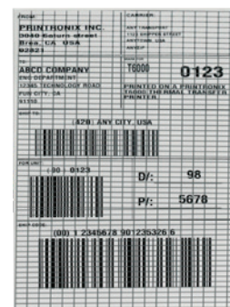
Full Overstrike Example (T8000 ODV-2D)

Software partners such as TEKLYNK already use this application connection to provide a close-loop label quality process.